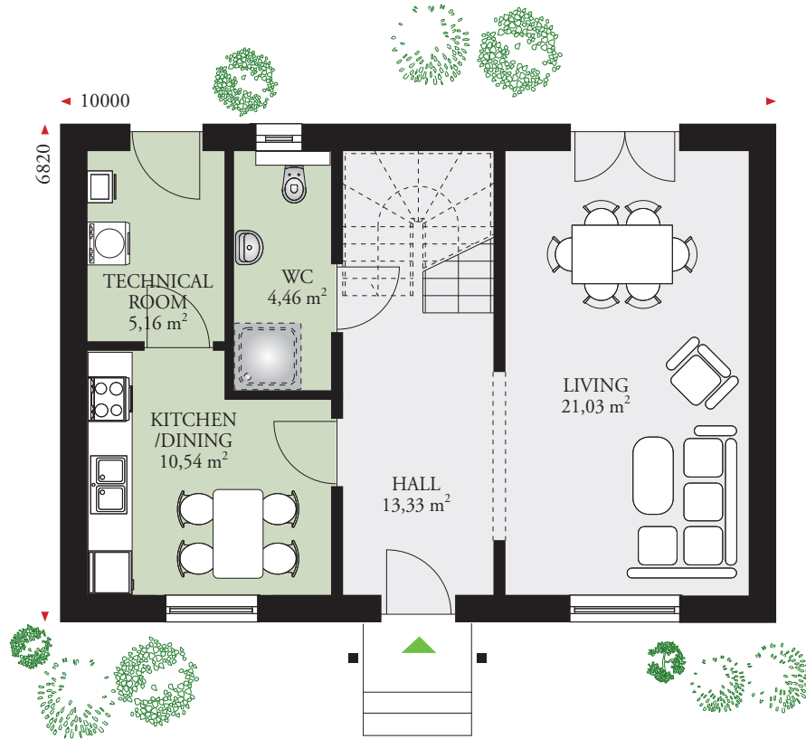
GROUND FLOOR AREA 57,07 m 2 (614 sq ft)