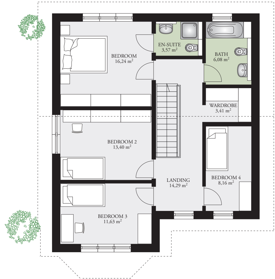
FIRST FLOOR AREA 81.29 m 2 (875 sq ft)