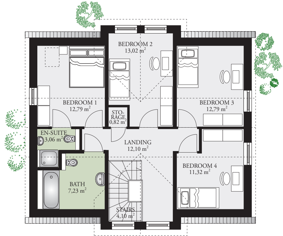
FIRST FLOOR AREA 82,67 m 2 (890 sq ft)