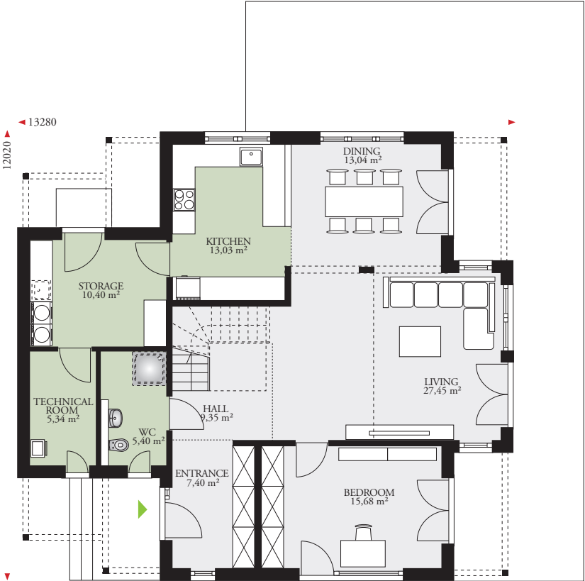
Ground floor area: 111,42 m 2 (1199 sq. ft.)