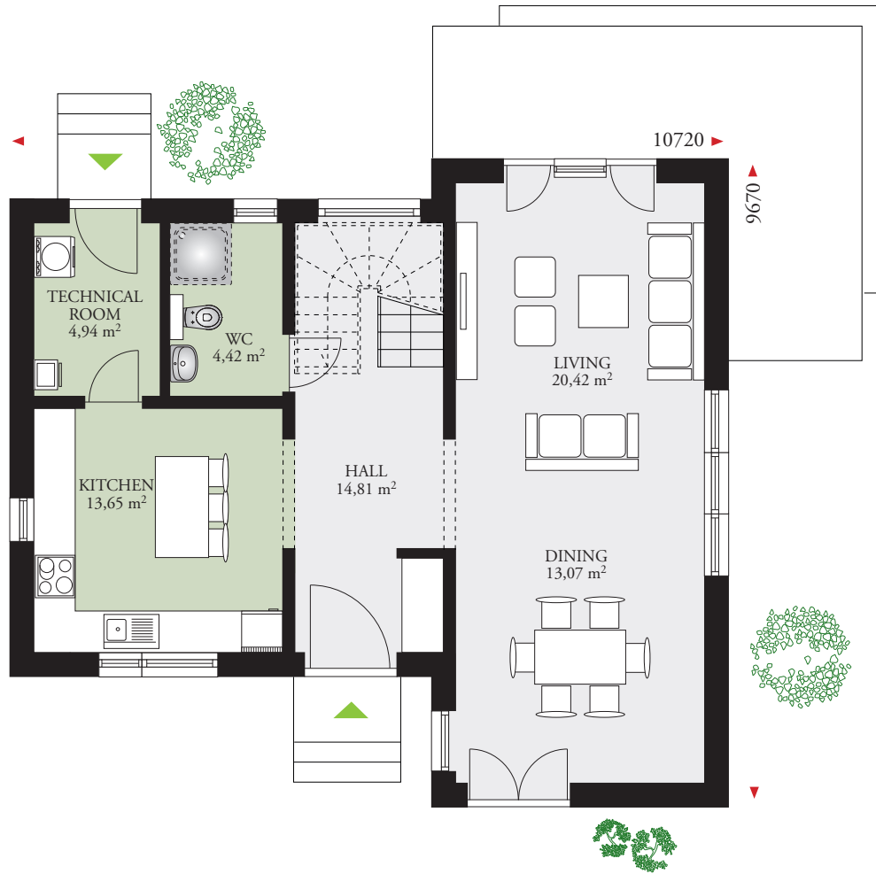
GROUND FLOOR AREA 74.00 m 2 (796 sq ft)