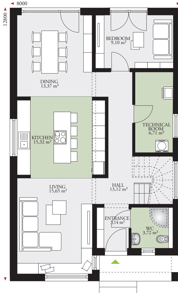
Ground floor area: 83,95 m 2 (904 sq. ft)