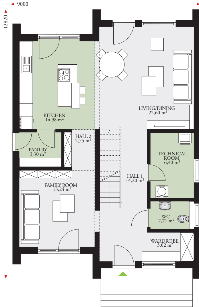
GROUND FLOOR AREA 87,35 m 2 (940 sq. ft)